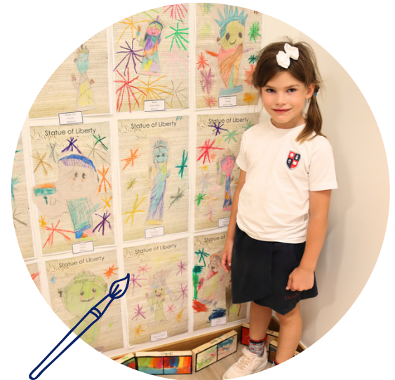
ELC Art Exhibition

Through artistic expressions such as painting and drawing, children explore graphic representation, which develops alongside writing and other fine motor skills. They have the opportunity to discover various works of art, learn to differentiate visual characteristics in objects, images, print, and letters, and develop an appreciation for the elements of art. Following the Core Knowledge sequence, ELC students engage in creating art inspired by famous artists, and they also analyze and discuss selected works of art, including their own creations.