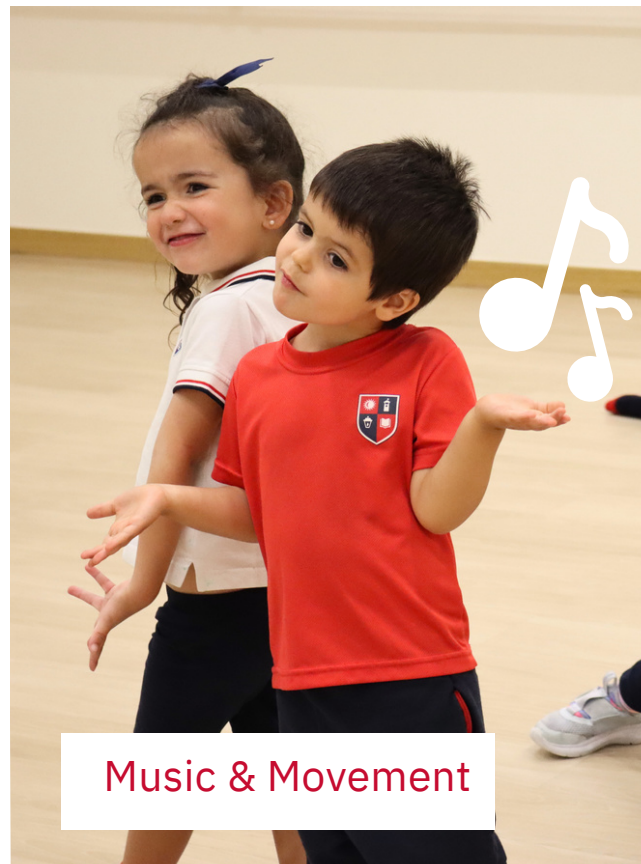
Music & Movement